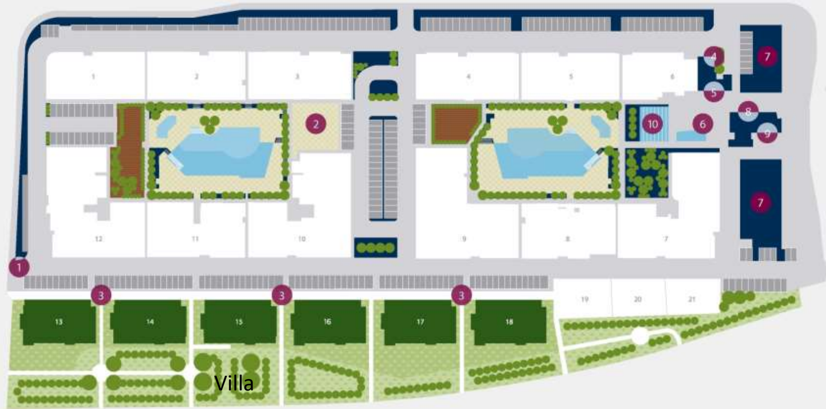
Elysia Park site plan